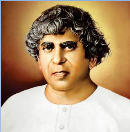
Sadhu T.L Vaswani (Nov 25, 1879-Jan 16, 1966) "The Child is the Life & Light of the Nation."