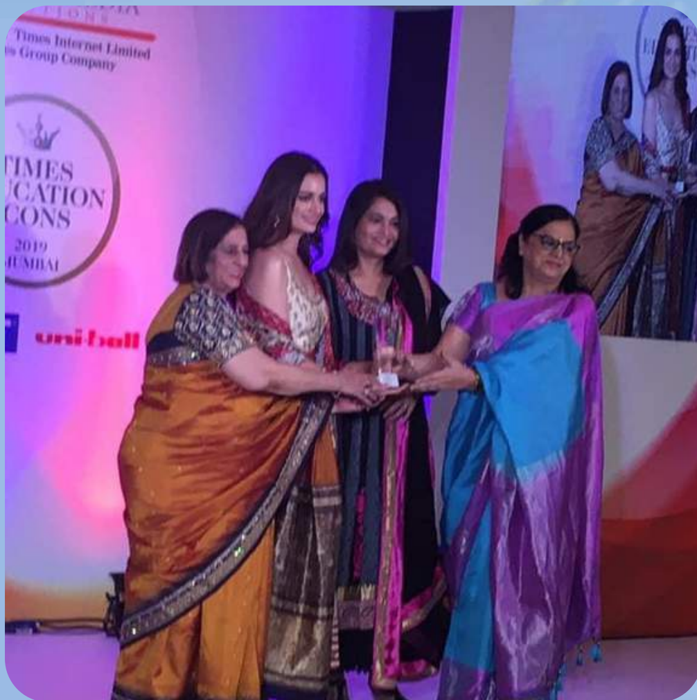
Winner of Swachh Survekshan Award For Navi Mumbai 2018-19