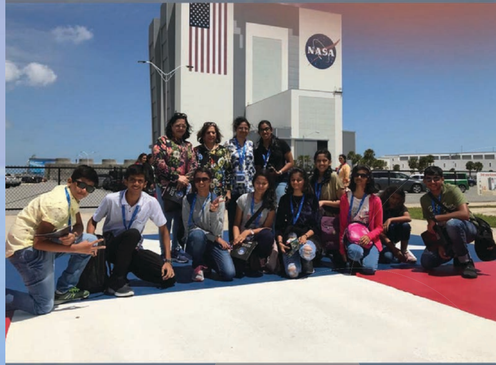
The United States