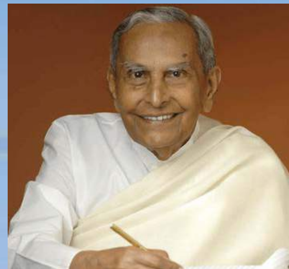
Dada J.P Vaswani (Aug 2, 1918-July 12, 2018) "New India will not be built in the Lok Sabha and Rajya Sabha but in our schools and colleges."

The Sadhu Vaswani International School is a sincere endeavor to promote the overall development of the child. It's uniqueness lies in not only building their intellect and acumen; in honing their skill and talent; in developing their physique and health; in unfolding their creativity and hidden potential; but above all in shaping their strength of character and firmness of will and most importantly in unfurling their spirit and inner beauty.